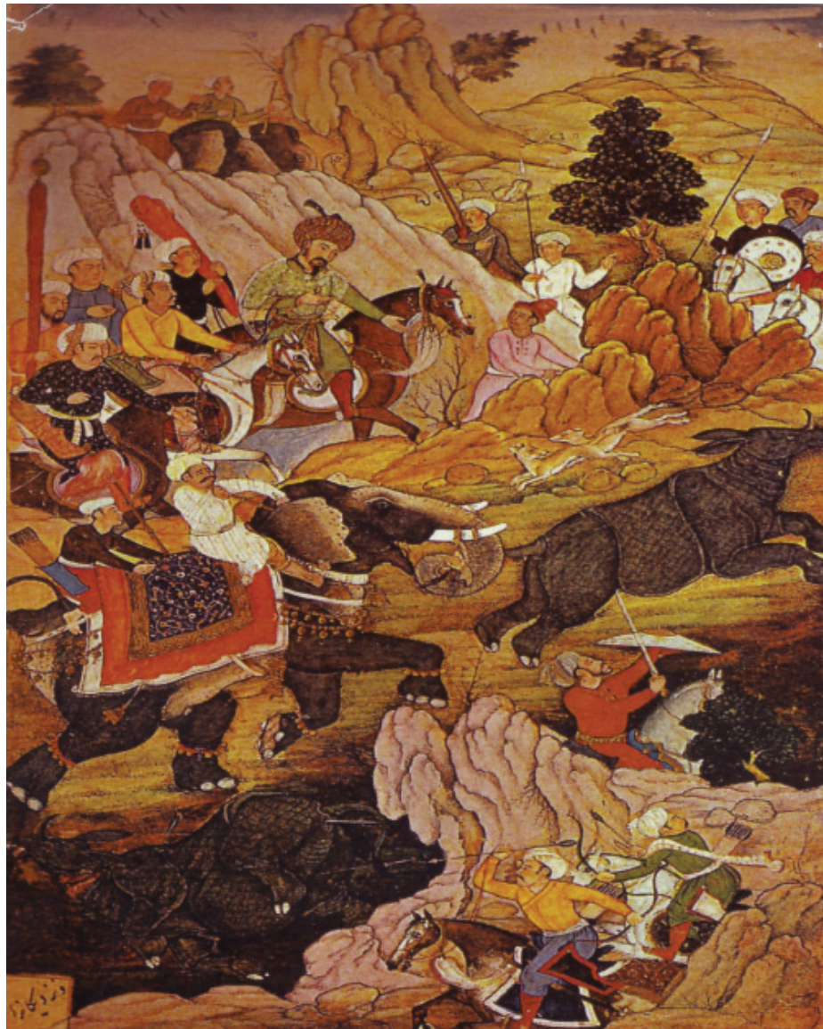
Fig. 7.1: Babur hunting Rhinoceros