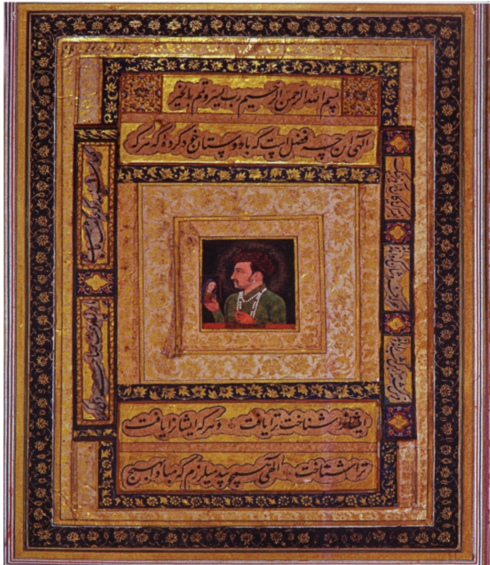
Fig. 7.4: Jahangir holding a Picture of Madonna