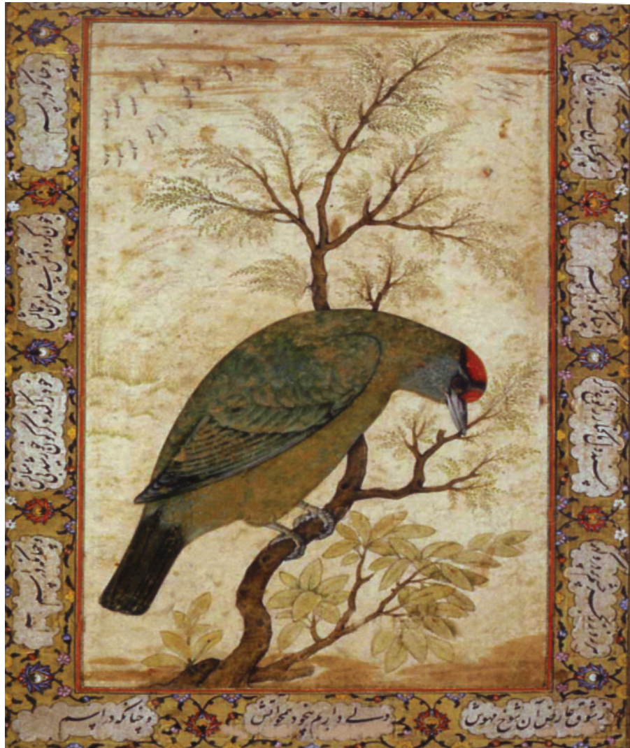
Fig. 7.3: A Barbet