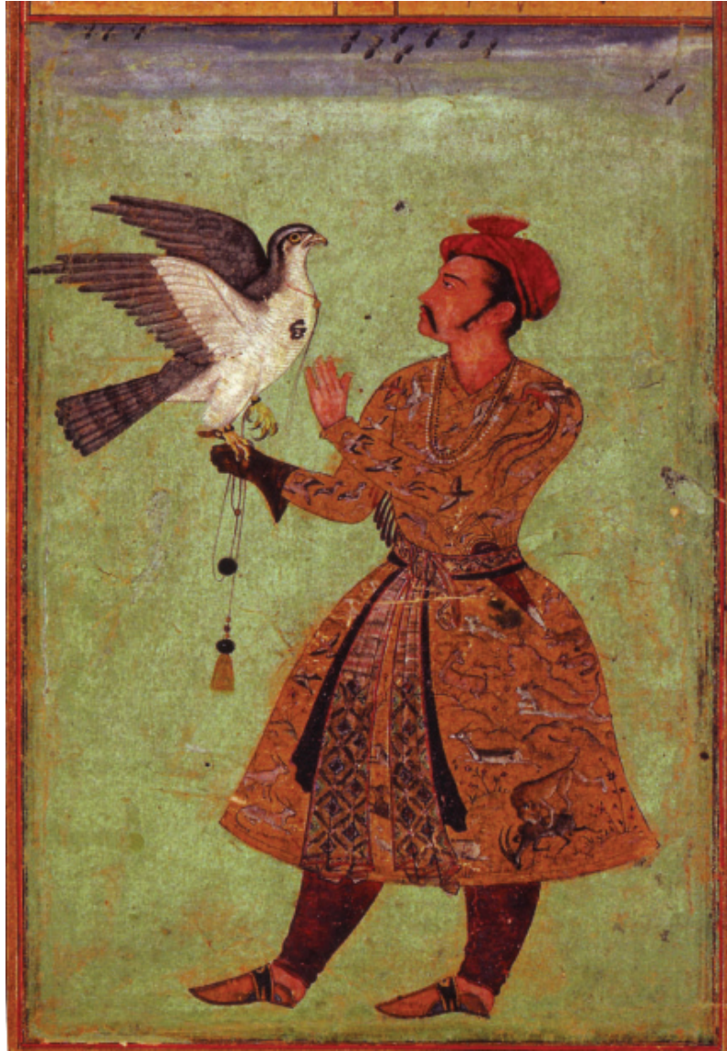
Fig. 7.2: Prince with a Falcon