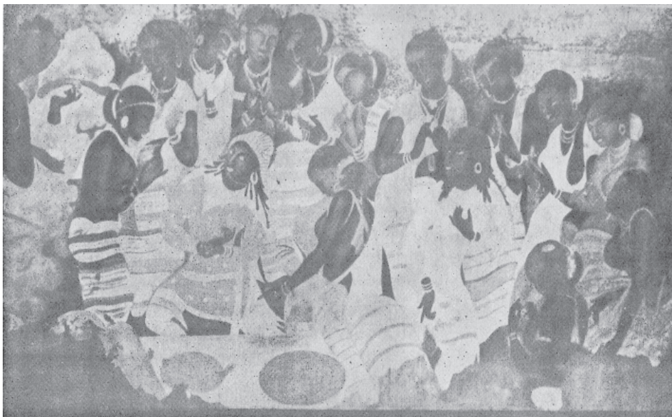
Fig. 3.4: Dancing Panel