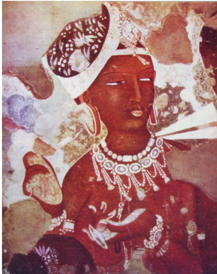
Fig. 3.2: "APSARA"

The Ajanta painters, have created many forms of female beauty. These include women from a royal family, courtesans, dancers, common women and Apsaras or nymphs.