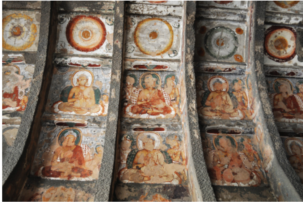
Fig. 3.3: “Decoration on the Ceiling