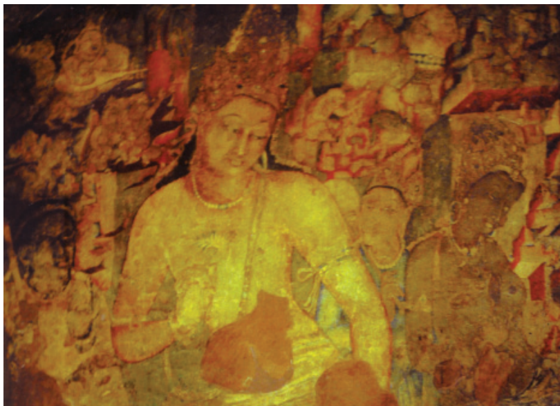
Fig. 3.1: “Bodhisattva Avalokitesvara”