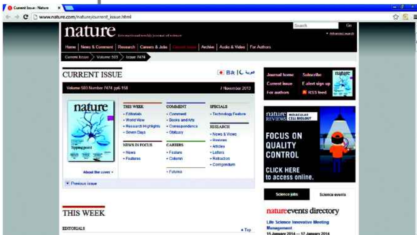
Fig. 8.1 Snapshot of Nature journal

The screenshot of Nature journal is given below: