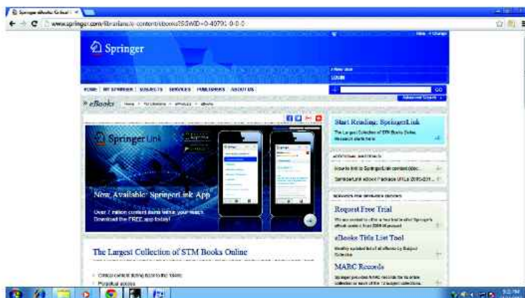
Fig. 8.2 Snapshot of Springer website