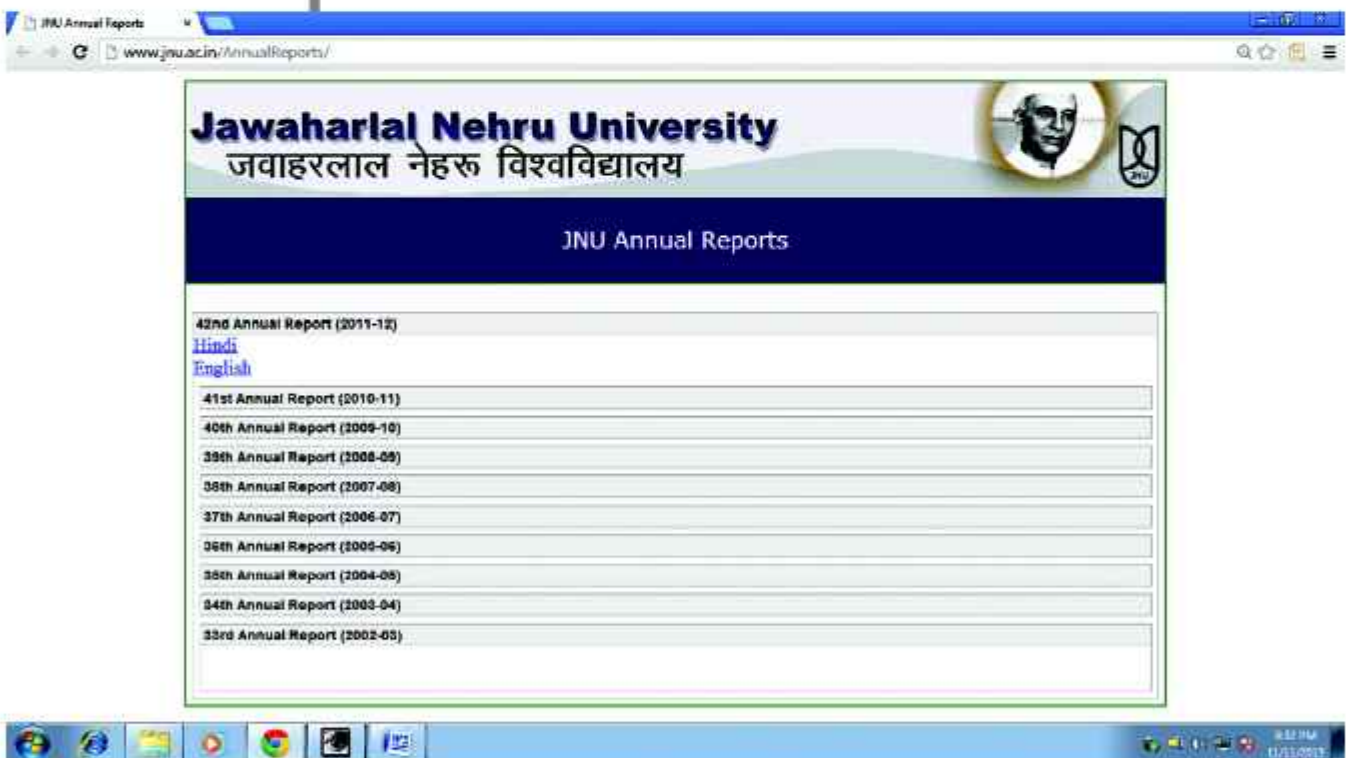
Fig. 8.5 Snapshot Jawaharlal Nehru University website

The screenshot of annual report of Jawaharlal Nehru University is given as under: