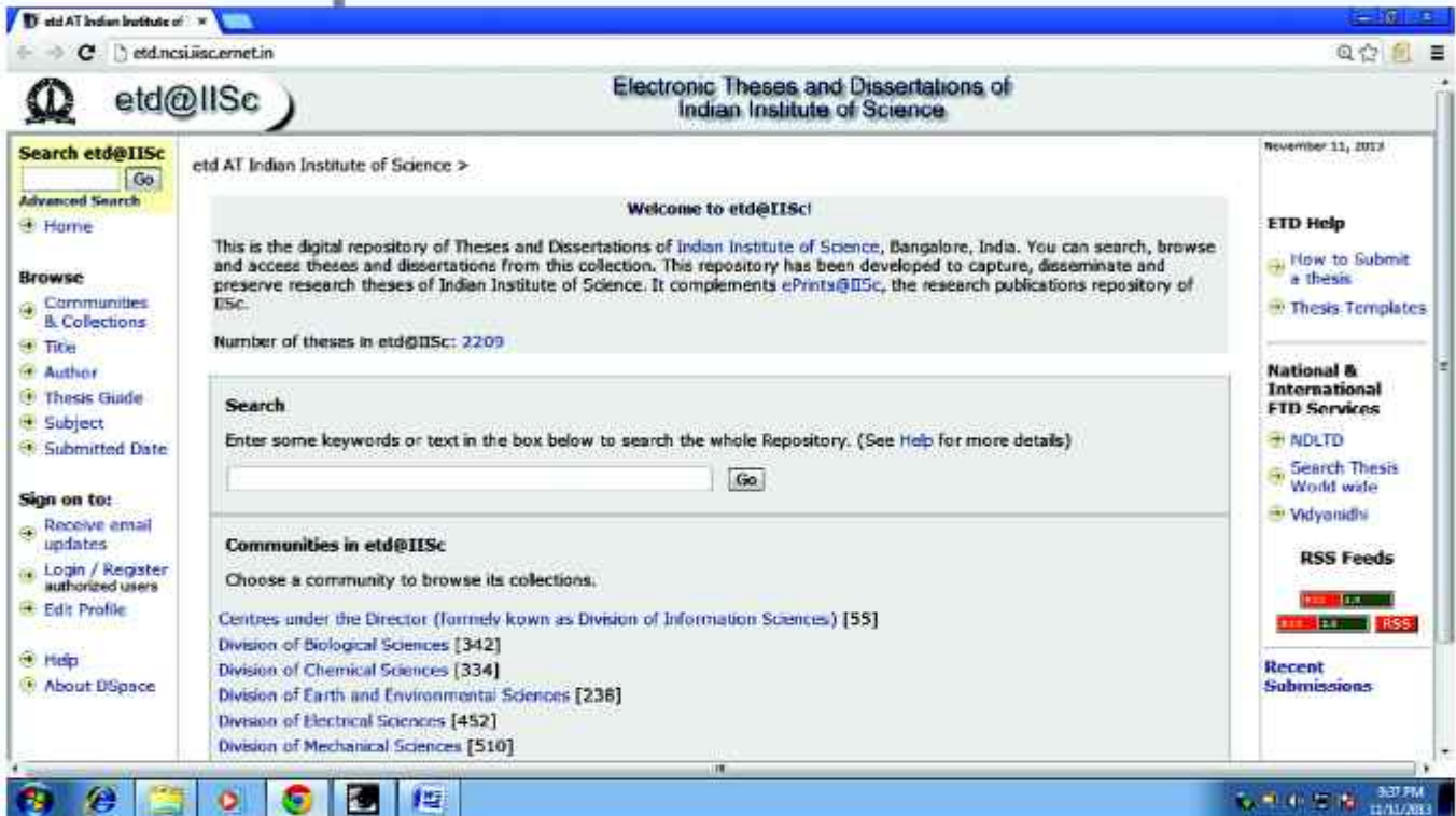
Fig. 8.7 Snapshot Institute of Science website

digitizing the theses and dissertations held by them and making them accessible on Internet. The collection of digital theses and dissertations is also known as digital repository. The screenshot given below shows the digital repository of Indian Institute of Science, Bangalore.