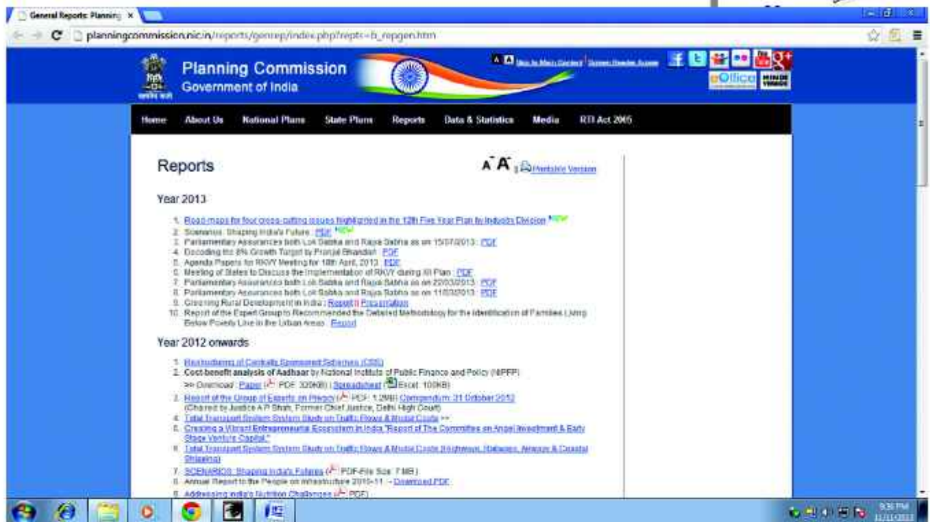
Fig. 8.6 Snapshot Planning Commission of India website

The Planning Commission, Government of India publishes reports of the various projects initiated and completed, committees constituted for accomplishing various tasks. The screenshot of reports published by Planning commission, Government of India is given as under: