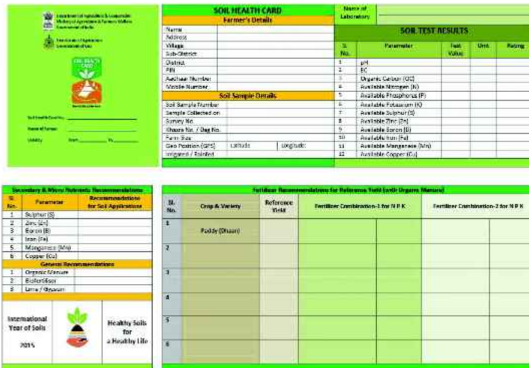
Fig. 14.4 Soil Health Card

The card displays farmer's detail, soil sample detail, soil test results and general recommendations. The sample of the Soil Health Card is given below.