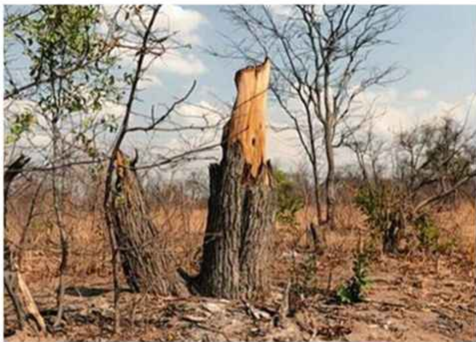
Fig. 14.1 Deforestation

It is estimated that during the last 40 years nearly one-third of the world's arable land has been lost to erosion and continues to be lost at a rate of more than 10 million hectares per year. -UNCCD Report