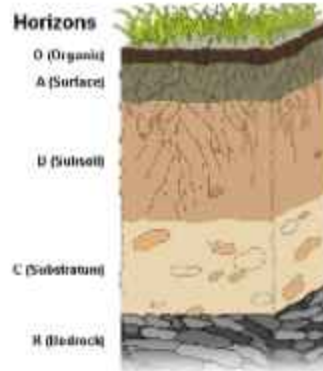
Fig. 14.2 Soil profile

Soils typically have six horizons. From the top down, they are Horizon O, A, B, C and R. Each horizon has certain characteristics. O Horizon is the top most layer, made up mostly of leaf litter and fresh organic matter. The A Horizon is made up of decomposed organic matter, micro organisms such as earthworms, fungi, bacteria etc. The B Horizon consists of less humus, but more minerals. The C Horizon is made up of broken bed rocks and R Horizon is the compact bedrock region.