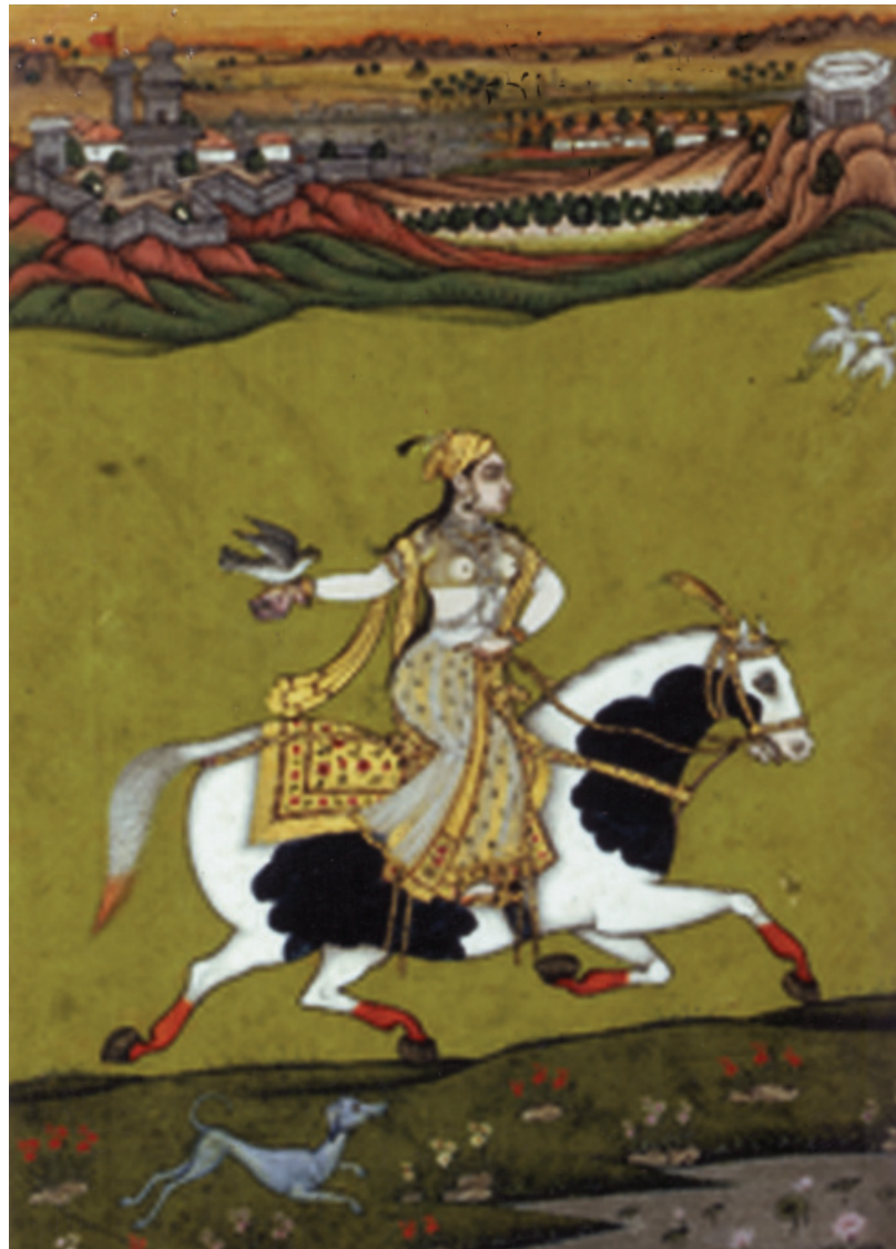
Fig. 9.3: Chand Bibi Hawking