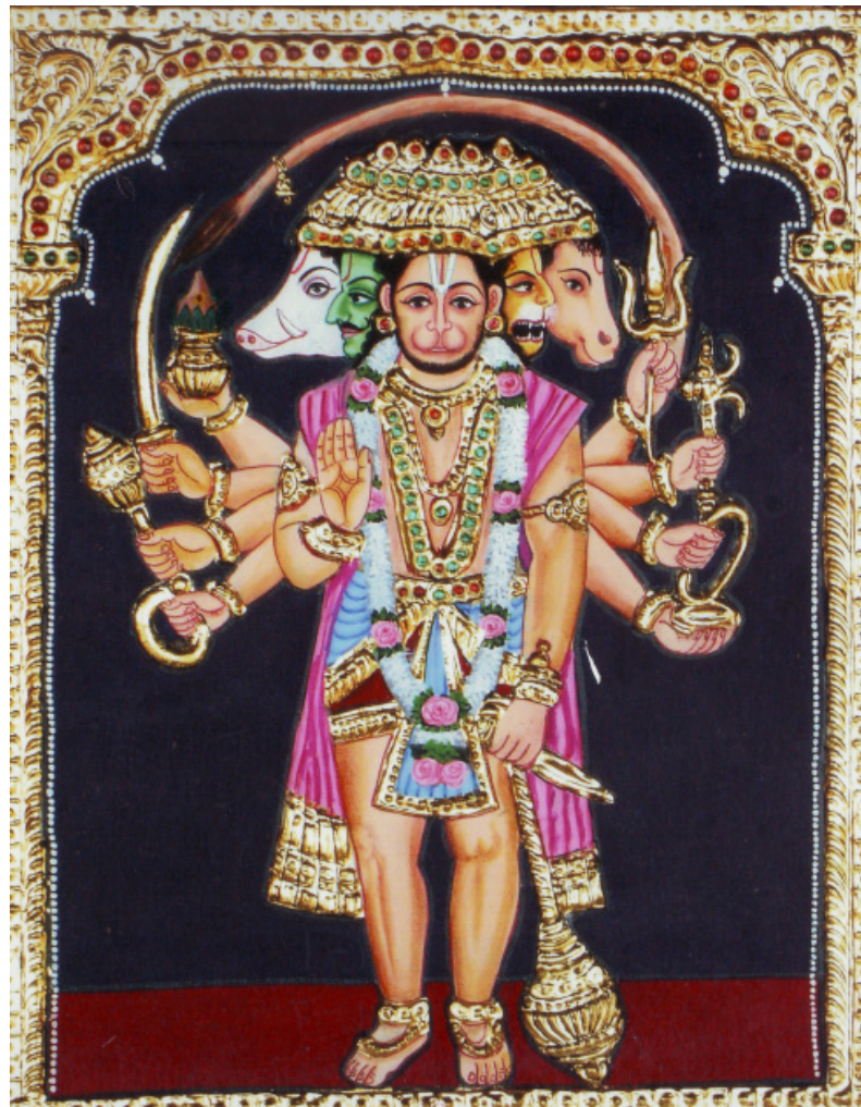
Fig. 9.1: Panchamukhi Anjaneya (The five-headed Hanuman)

This important style of painting is named after Tanjore (Tanjavur) in modern-day Tamilnadu, where it originated. Its golden period was between the 16th and the 18th centuries when it flourished under the patronage of the Nayak rulers under the suzerainty of the Vijayanagar Rayas and the Maratha court. The Raju community of Tanjavur and Trichy and the Naidu community of Madurai were instrumental in developing this style. The subject of these paintings is mainly Hindu gods and goddesses, royal personages and celestial beings. Since they were originally painted on fabric stuck on wooden planks, they were called ‘Palagai Padani’ (literally pictures painted on wood) in Tamil.