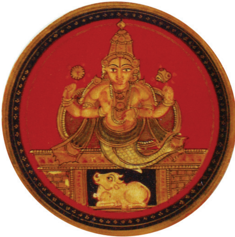
Fig. 9.2: Matsyavatara (Ganjifa Card)